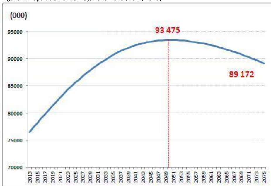
Figure 1: Population of Turkey, 2013-2075 (TÜİK, 2013)

As seen figure 1, The population will increase slowly to the year 2050, and it will reach to its highest value with 93 475 575 people in this year. After 2050, the population will start to decline, and it is expected to be 89 172 088 in 2075. If the current trends of demographic indicators persist, the population of Turkey will continue ageing. Elderly population, which is the population at 65 years of age and over, is 5.7 million in 2012 with a proportion of 7.5% and this population will reach to 8.6 million people with a proportion of 10.2% in 2023 (TÜİK,2013).